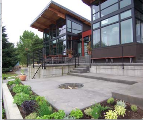
This 5,800 square-foot residence in the Pacific Northwest is designed by Martha Berndt.

The Solution: Daikin Altherma was a perfect fit as it is highly efficient with a COP rating on the model used in excess of 4.0. It has the ability to produce 120 degree water which is ideal for domestic hot water and the radiant application selected for the project.